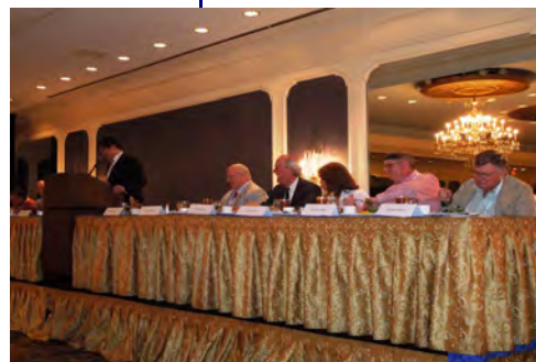
Members of the board and distinguished guests sit at the head table during the Veterinarian Luncheon and Business Meeting.